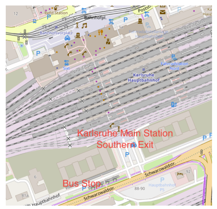
Pick up location Karlsruhe Main Station. Please, ensure that you leave through the southern exit. In case you see trams, you are on the wrong side.